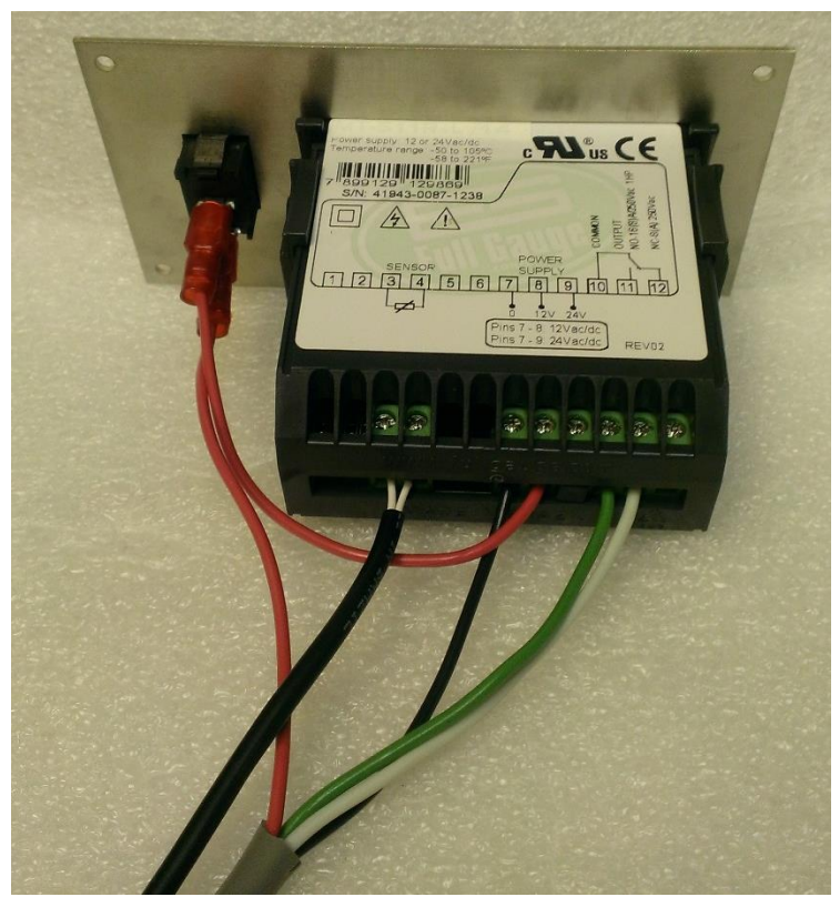
Thermostat Electrical Wiring Connections (Shown assembled with the On/Off rocker switch in the mounting bracket)

Locate the stainless steel thermostat mounting bracket (015-0000) and mount the On/Off rocker switch (017-3101) and the Full Gauge digital thermostat (015-0010) into the bracket. The "O" on the On/Off rocker switch should be below the "I". The switch will pop right in into the smaller hole of the bracket. Remove the plastic bracket on the digital thermostat, insert the thermostat through the larger hole from the front side of the bracket, and reattach the plastic bracket to the thermostat on the back side of the bracket.